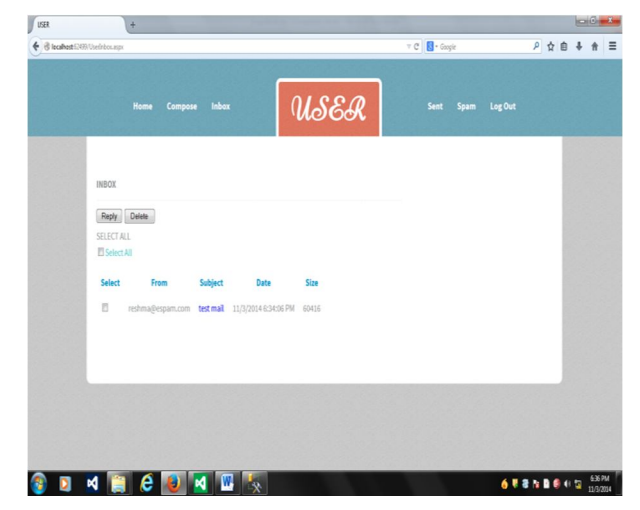
5.5 Inbox Mail